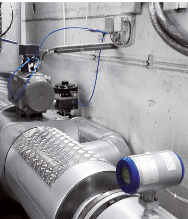
4. "DE" Station line 6 return flow BSV DN 250