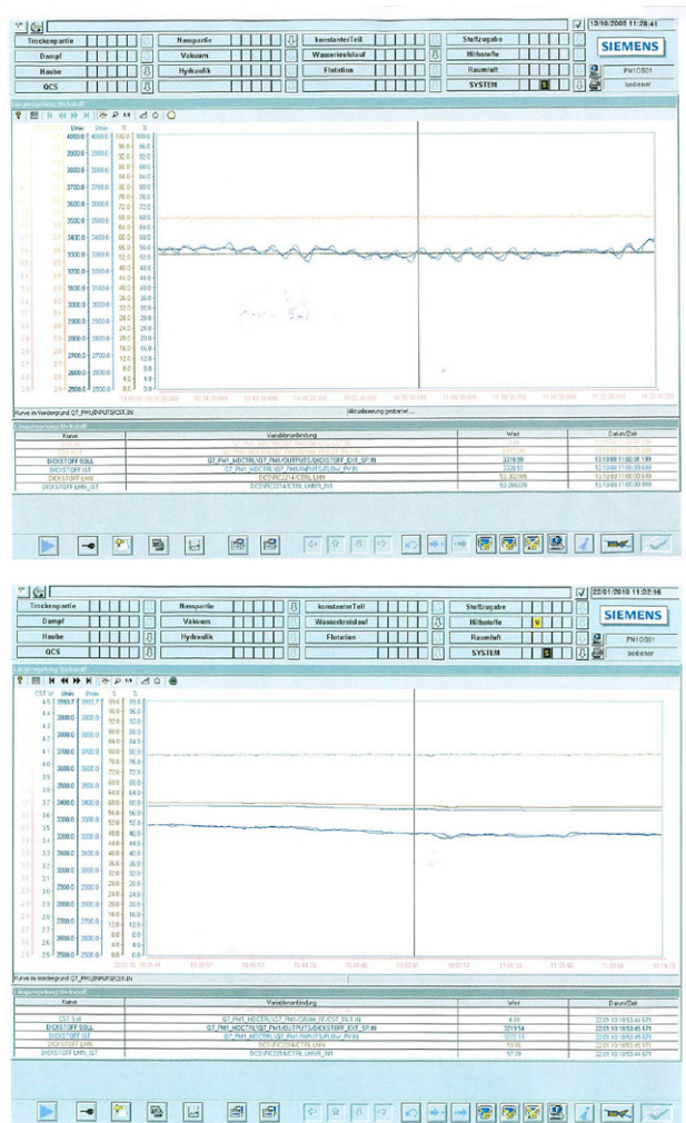
Fig. 3: Dosage metering of additives old valve (top) with strong fluctuations and new valve with precision servo motor drive (below).

In this way volumetric flows such as in the case of paper manufacturing can be controlled and regulated to extremely precise levels. “We can now correlate exactly the valve position of the paper