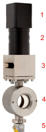
Fig. 1: an illustration of a very accurate precision control valve – the ball sector valve (4) is combined with a servo motor (1) and a planetary drive (2). By means of the Absolute-rotational angle transducer (5) the exact position of the ball sector is calculated with out any force applied and the signal then relayed to the controls. The valve can be positioned with the emergency manual actuator (3) even in case of power failure.

“With a larger valve every incorrect positioning step caused more trouble than would be the case with a smaller valve”, said Reinhard Christes, Head of Electrical, Measurement and Control Engineering at Grünewald Paper. “The change of valve size led to a completely inadequate level of accuracy and the consequences were unacceptable fluctuations in the paper grammage weight. “For that reason the stepper motor was replaced with a newly developed precision servo motor drive from Schubert & Salzer.